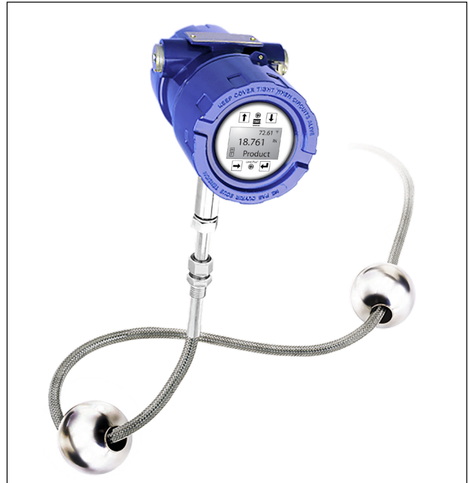
Fig. 2: Tank Slayer® transmitter