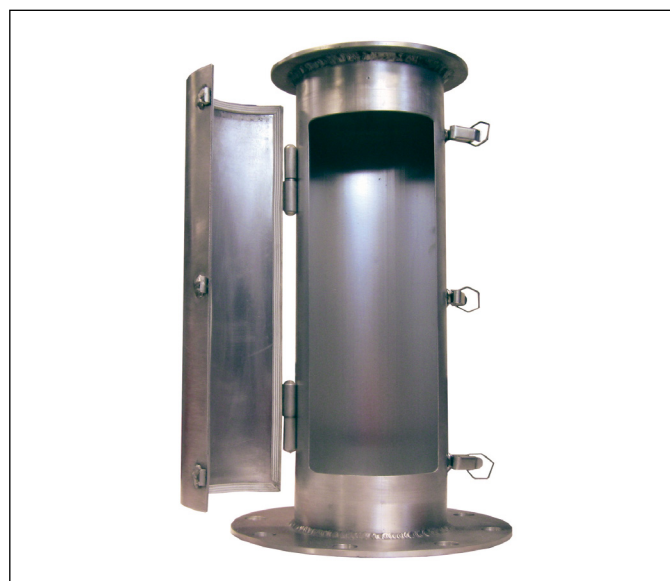
Fig. 4: Spool piece with open door

MTS has a better solution. Install the Tank Slayer® transmitter and a spool piece (as shown in 'Figure 4') mounted on top of your stilling well. Unlike other level transmitters, the Tank Slayer® does not have to be removed or taken out of service during manual gauging, sampling or installation.