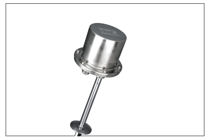
Fig. 3: M-Series SoClean® Transmitter with NEMA Type 4X Sanitary Enclosure

Level Plus SoClean® transmitters are designed for simplicity and ease of use. Once the level transmitter is installed in the tank it should not have to be removed. However, sanitary transmitters are designed to be fully field replaceable. This means if the electronics or the sensing element becomes damaged, they can easily be replaced from the top of the vessel without removing the pipe assembly. This design has been developed to reduce downtime or draining the tank. If required, MTS Sensors can provide detailed instructions on how to replace the electronics and sensing element. By design, Level Plus liquid-level transmitters have lower maintenance costs as general maintenance can be performed in the field without a service call.