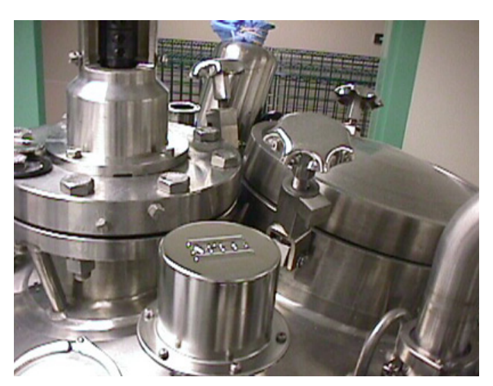
Fig. 2: SoClean® transmitter

No other technology offers better accuracy under such harsh conditions. The SoClean® level transmitter is immune to the effects of foaming, misting, steam, condensation, and agitation. MTS is also not effected by changes in dielectric constant as liquids change during a mixing process. Stop wasting time and money on recalibrating and recommissioning the wrong level technology. Move to a better product and use the SoClean® level transmitter for Bioreactors, CIP tanks, and other applications.