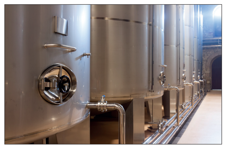
Fig. 3: Stainless Steel Wine Barrels (Designed by Bearfotos / Freepik)

Nobody likes paying taxes and absolutely nobody likes paying more taxes then they need to. Distilleries in the US are required to pay tax on their production volume and not their sales volume. To help minimize taxes the distilleries faced a difficulty of needing an accurate level transmitter that could be used in a hazardous area on large storage tanks. Temposonics and the Tank SLAYER® were able to meet the requirements by providing an intrinsically safe rating, +/- 1 mm inherent accuracy, and an order length up to 72.2 feet (22 m). The accuracy of the Tank SLAYER was able to help the distilleries to save on wasted product and wasted taxes. The complete construction of 316 stainless steel (1.4404) allowed for a cleanable service and no concerns about product contamination.