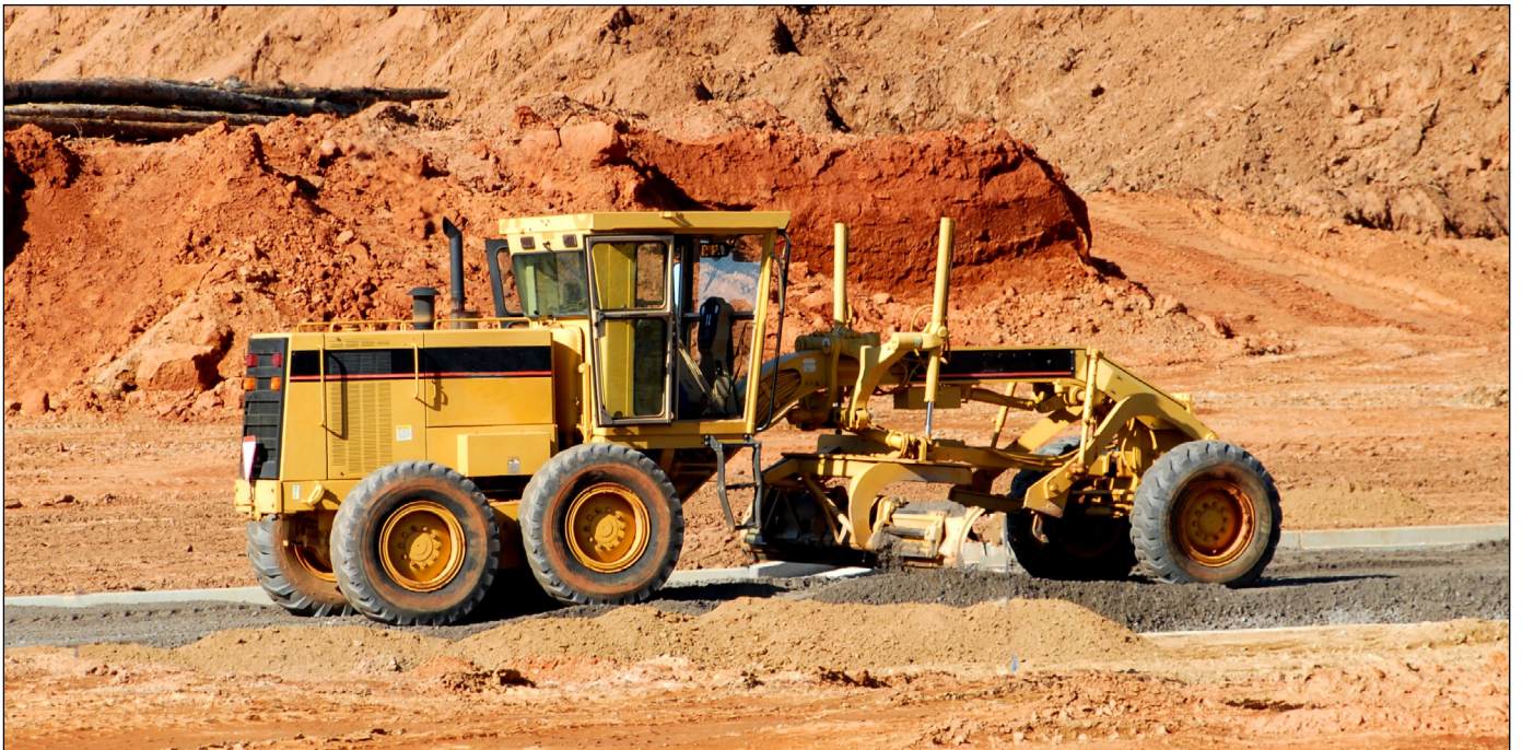
Fig. 1: A grader doing it's work

Temposonics® Sensors inside hydraulic Cylinders can provide new features