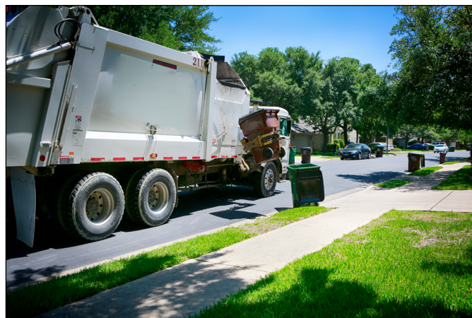
Fig. 3: Garbage truck side-loader

In addition to speed, accuracy and noise reduction are critical to keeping customers happy. Container capture and dumping systems that miss the target can cause unpleasant or even dangerous spills, not to mention delays. Keeping noise to a minimum increases the ability of the waste hauler to run routes at early morning or late evening times when a loud banging of a garbage can getting slammed at high speed into the bed of a truck would be cause for complaint.