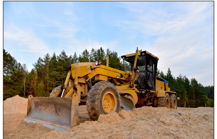
Fig. 4: Grader

The design teams continue to be inspired by what the new sensors can do and are now investigating advanced vehicle diagnostics to drive preventative maintenance and identify hazardous conditions such as sudden loss of hydraulic pressure or the leaking of hydraulic fluid.