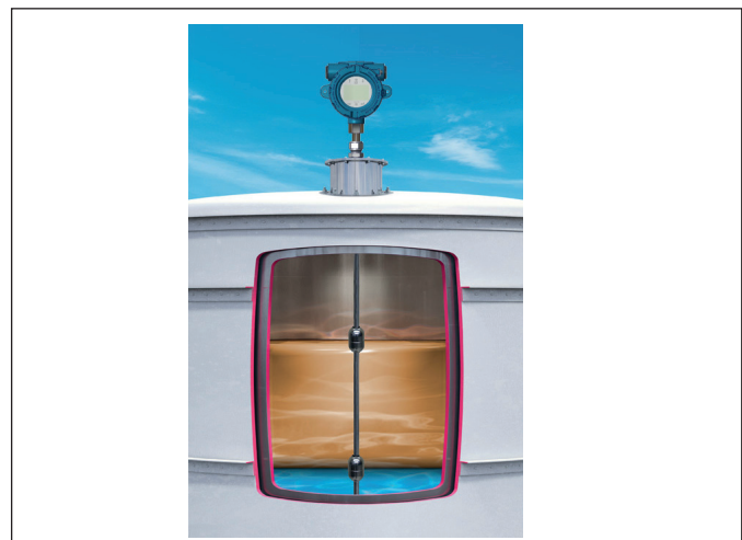
Fig. 2: Example of product and interface level measurement